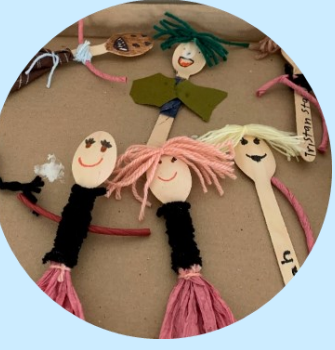
Use your imagination to create a spoon doll