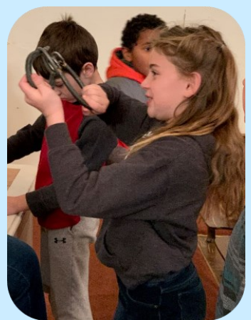
Play with games and toys children a hundred years ago might have used