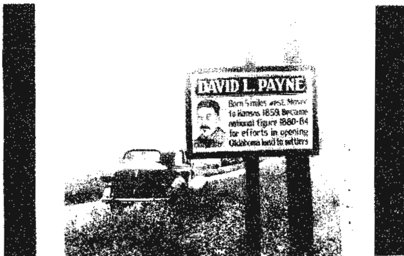
Indiana Historical Society honors David L. Payne with a highway marker.

the land he worked so persistently to open for settlement.