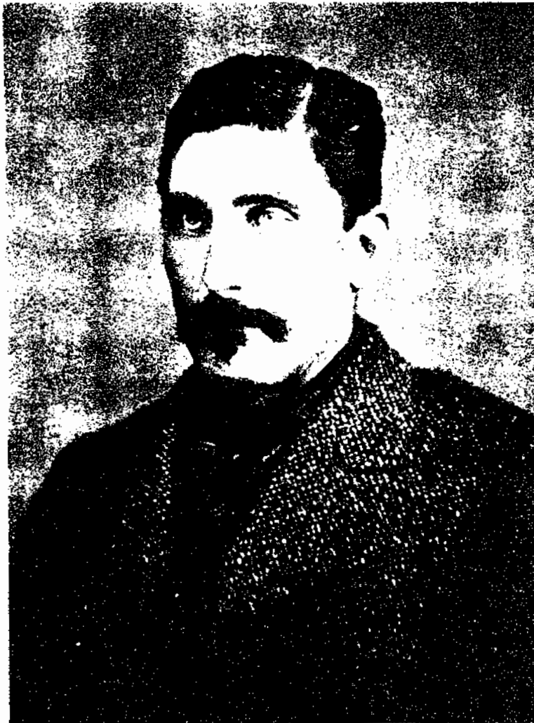
Captain D. L. Payne "the Father of Oklahoma"